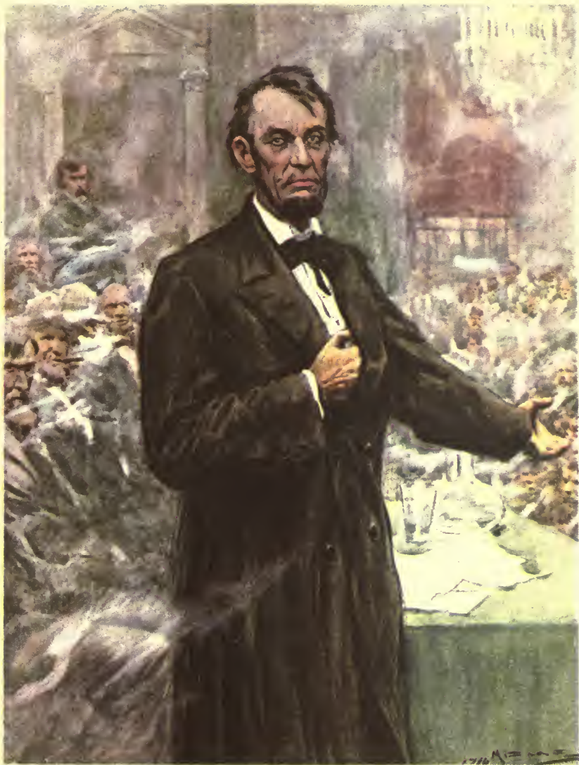
ABRAHAM LINCOLN, THE GREAT EMANCIPATOR

Here highly resolve that these dead shall not have died in vain—that this nation, under God, shall have a new birth of freedom—and that government of the people, by the people, for the people, shall not perish from the earth.